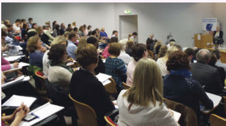
Memory Clinic Conference 17th June 2016 Trinity Sciences Centre St James's Hospital