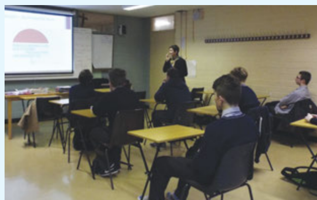
A Group of Students from CBS James's Street

Several of these students have grandparents who have dementia and with whom they have very close contact.